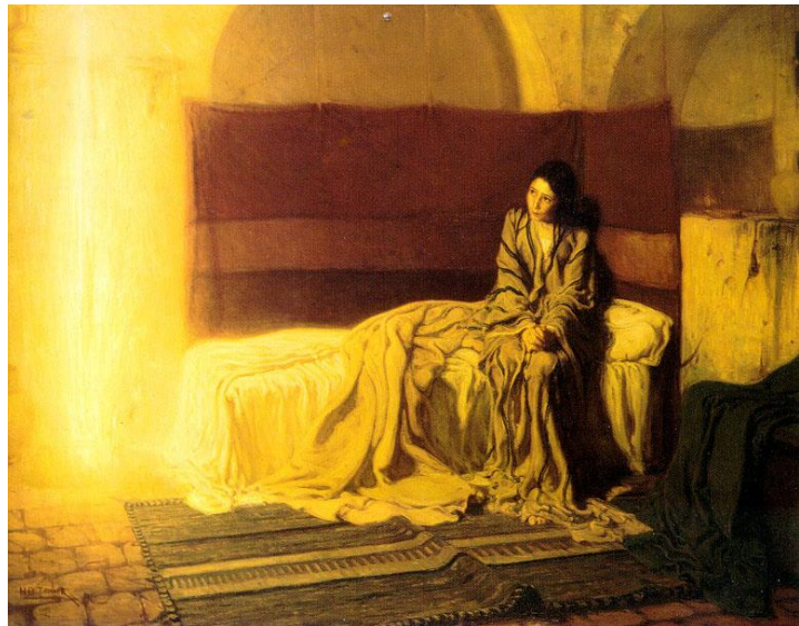
The Annunciation , Henry Ossawa Tanner, 1898

Mary, show us how. Teach us to trust in God as you have. Let us do what sometimes seems unthinkable in this world: to be humble and to accept without always understanding why or how.