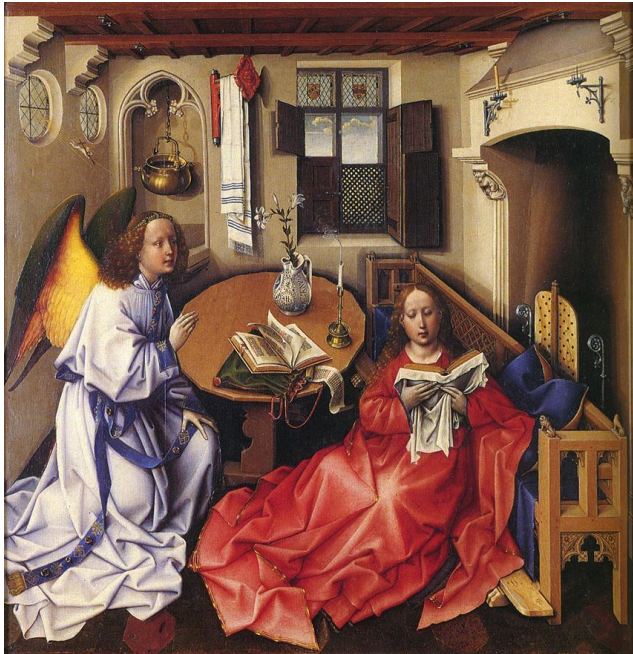
Annunciation Triptych (Merode Altarpiece) Workshop of Robert Campin, c. 1427–32

We have heard the story so many times over the years, it sometimes fails to astonish us. The