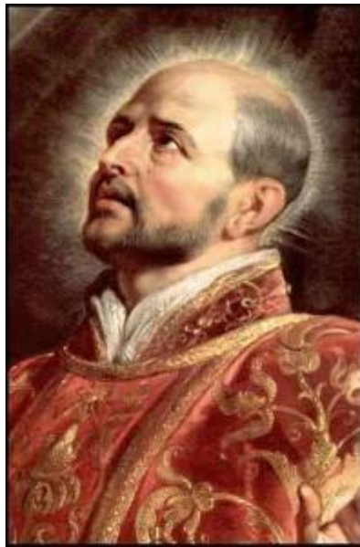
St. Ignatius Loyola

Lord, teach me to be generous. Teach me to serve you as you deserve; to give and not to count the cost, to fight and not to heed the wounds, to toil and not to seek for rest, to labor and not to ask for reward, save that of knowing that I do your will.