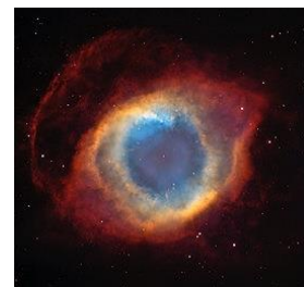
Helix Nebula The Eye of God