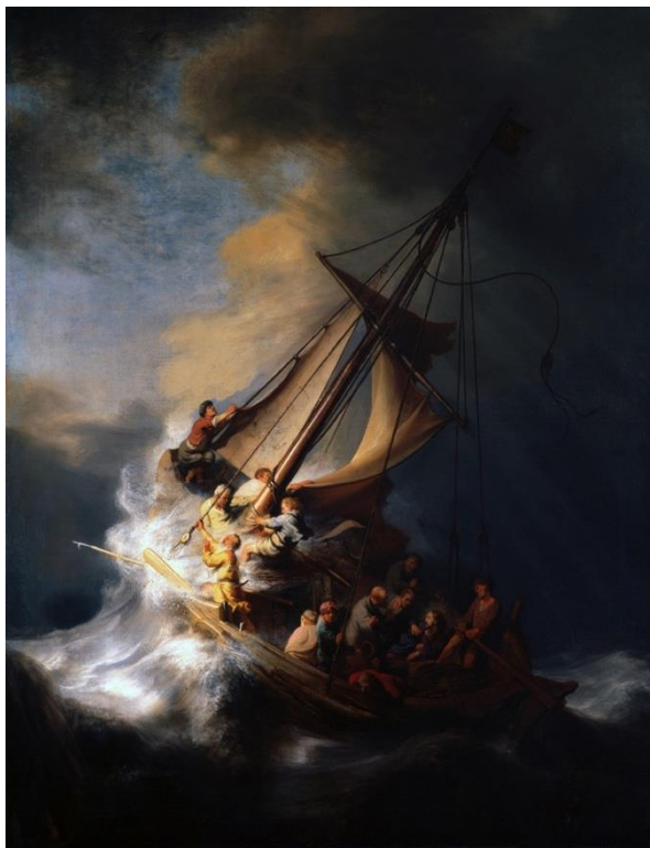
The Storm on the Sea of Galilee, Rembrandt,

Then he got into the boat followed by his disciples. Without warning a storm broke over the lake, so violent that the waves were breaking right over the boat. But he was asleep. So they went to him and woke him saying, "Save us, Lord, we are going to drown!" And he said to them, "Why are you so frightened, you men of little faith?" And with that he stood up and rebuked the winds and the sea; and all was calm again. The men were astounded and said, "Whatever kind of man is this? Even the winds and the sea obey him."