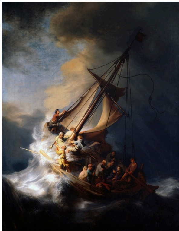
The Storm on the Sea of Galilee, Rembrandt,

Then he got into the boat followed by his disciples. Without warning a storm broke over the lake, so violent that the waves were breaking right over the boat. But he was asleep. So they went to him and woke him saying, "Save us, Lord, we are going to drown!" And he said to them, "Why are you so frightened, you men of little faith?" And with that he stood up and rebuked the winds and the sea; and all was calm again. The men were astounded and said, "Whatever kind of man is this? Even the winds and the sea obey him."