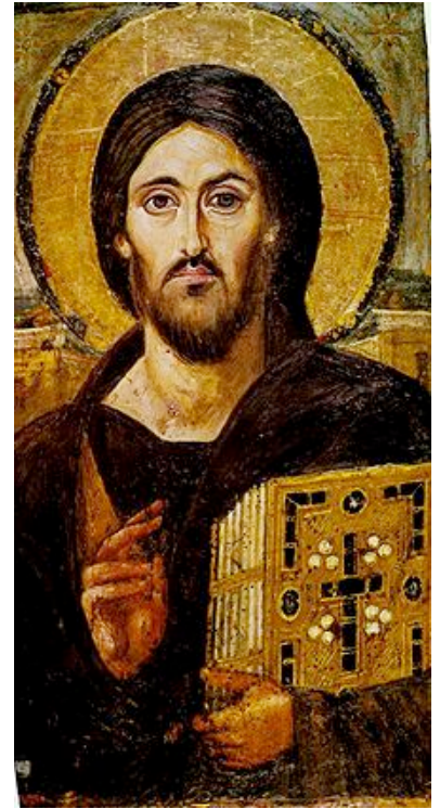
Oldest icon of Christ Pantocrator Saint Catherine's Monastery, Mount Sinai