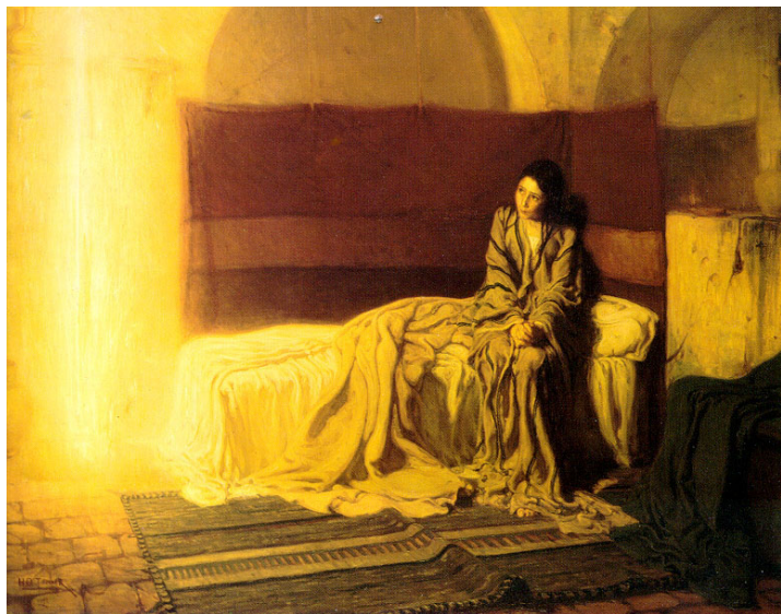
The Annunciation , Henry Ossawa Tanner, 1898

And deep in our own souls, we pray with the same heart, asking for the fears to be eased, asking to feel God walking with us in this daily path of life, not certain that we can handle everything that is coming.