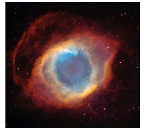
Helix Nebula The Eye of God